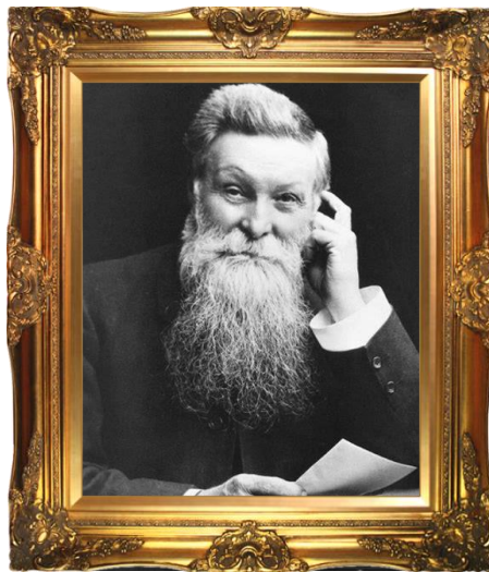
John Dunlop Born in 1840 An expert in rubber Invented the first inflatable tyre

hard/ soft stretchy/ stiff shiny/ dull rough/ smooth flexible/ not flexible waterproof/ not waterproof