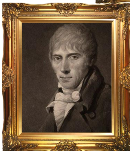
John McAdam Born in 1756 He invented building roads with a smooth, hard surface.